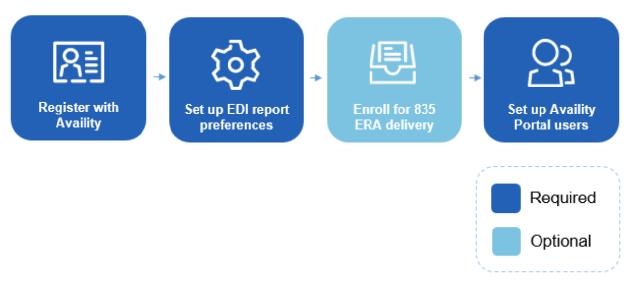
Figure 2: Setup tasks for submitting files through the Availity Portal

Note: To complete the post-registration setup steps, you'll need an Availity Portal account. If you don't have an Availity Portal account, contact the Availity administrator for your business and ask them to create one for you.